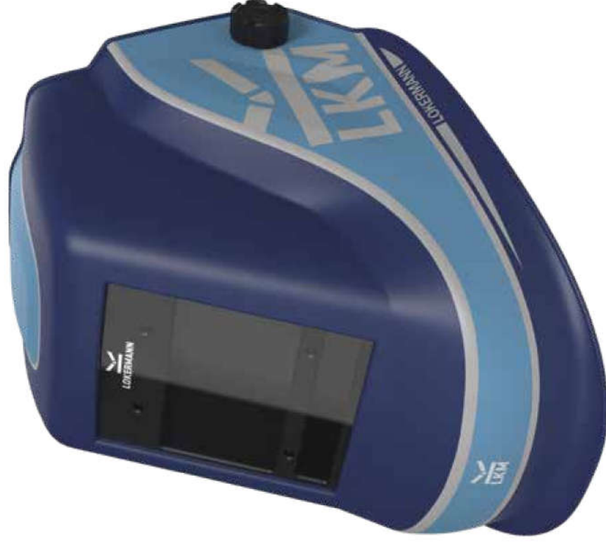
REAL VISION TECHNOLOGY

VISTA HD combines high performance, comfort and an innovative design and make it an auto darkening welding helmet suitable to all the welding processes. Wide view size (100x60mm) and Real Vision Technology increase safety and efficiency of the welder. Fully digital control permits an easy adjustment of shade (DIN 9-13), of the sensitivity and delay. 4 sensors allow maximum precision in darkening time and better safety to the welder. Grinding function increases safety during the grinding operations. SUPER COMFORT HEADGEAR allows to adjust the position of the helmet with maximum care in order to use the helmet with the utmost comfort. "SAVING MODE" switches off automatically the ADF when the ambient light intensity is less than 3 lux while it switches on automatically the ADF in standby state when the ambient light intensity is above 10 lux saving power consumption. "EXTRA HEAT STABILITY" is the new function that blocks the ADF in dark state when the working temperature exceeds the 120°C ensuring the safety of welders operating in extreme conditions. VISTA HD is the auto darkening welding helmet ideal for the welder that need high performance in all the welding processes.